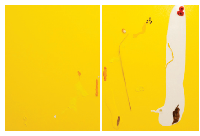
Actually, 2013 Diptych, acrylic and found object on canvas 80 x 120 cm

In a previous exhibition held at the La Trobe University Visual Art Centre in Bendigo, Southall exhibited another large triptych titled Not of This World, Only in It , a bold, tactile work of great simplicity and lineal masses. This painting gifted to the La Trobe University is currently installed at the Bundoora campus administration building.