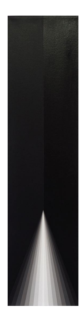
Iĉone #4 2015 Acrylic on stretched paper 15.3 x 61cm